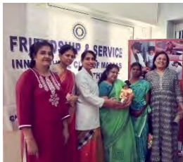
Inner wheel of Central Aadithya