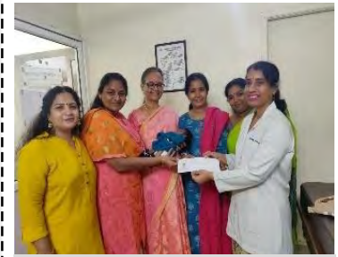
Inner Wheel of Madras north

Giving is not just about donation, its about making a difference. Our Benefactors are the Light, that bring in sunshine into the dark corners of the life of the needy. Here's to all our benefactors, the dedicated people who give selflessly their time and their support. Thank you for your act of generosity and kindness. Radhatri Nethralaya and team expresses it's gratitude to all those who have supported, and continue to support our cause.