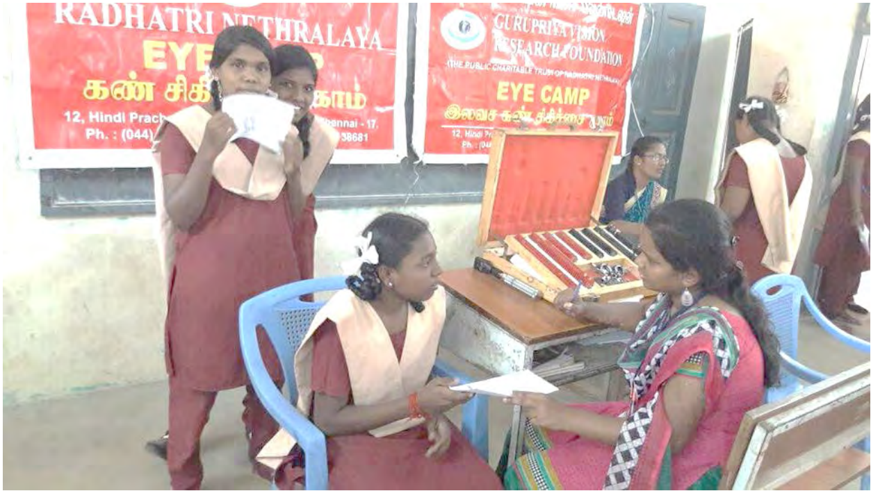
Optometrist checking vision of the school students in camp