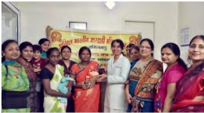
All India Marwadi mahila Mandal