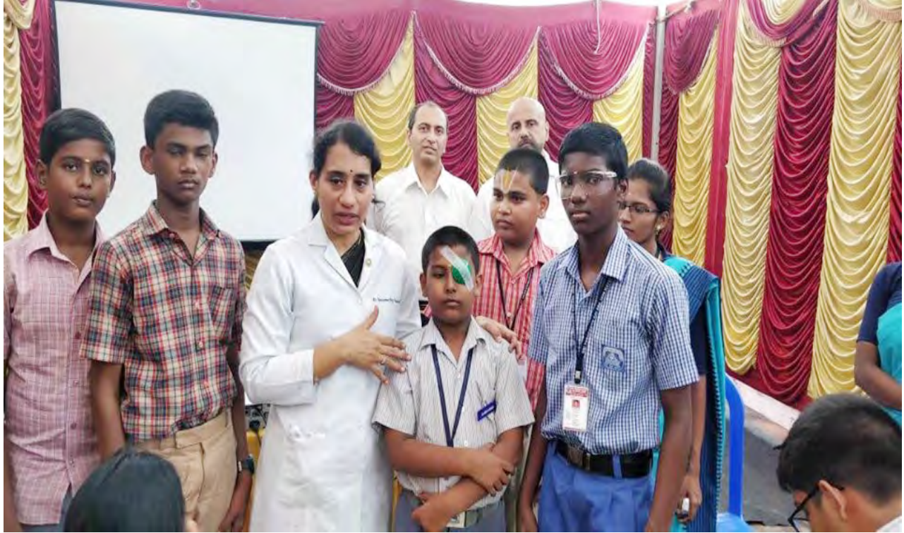
ISSUING THE CERTIFICATE TO THE PARTICIPATE STUDENTS