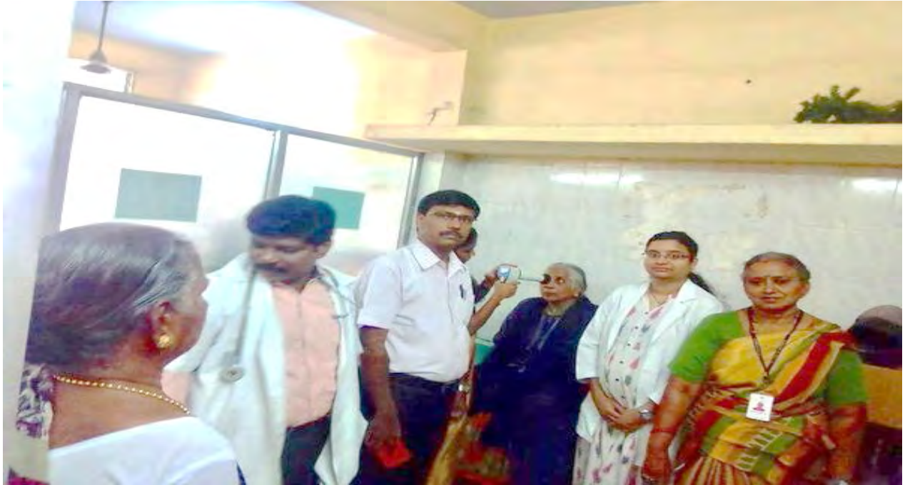
Taking retinal photography in hand held fundus camera in DIATEL-R camp